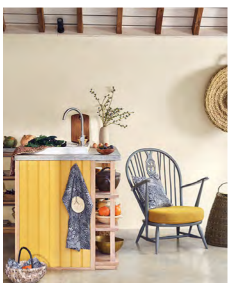
Cabinetry: Sunflower, Walls: Pearwood, Tea Towel & Cushion: Pure Marigold Fabric 226484