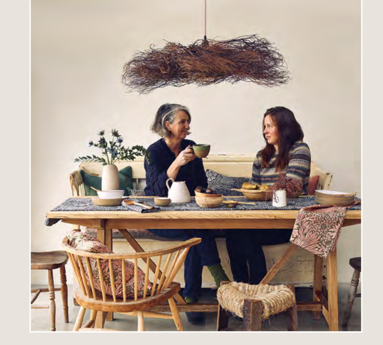
Your Curated Home