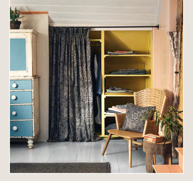
Your Curated Home