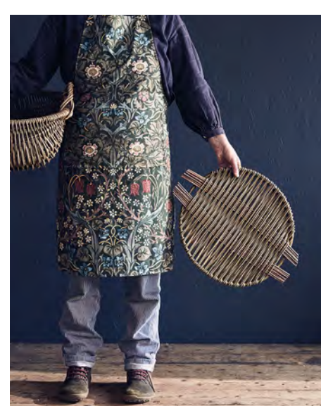
Wall: Inky Fingers, Apron: Blackthorn Fabric 226707